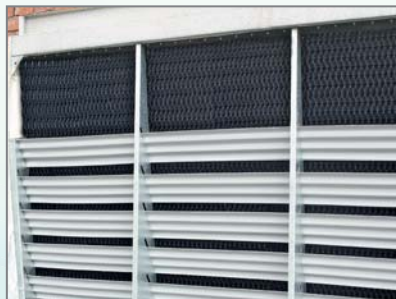
Mr. GoodTower® High Efficiency Fill