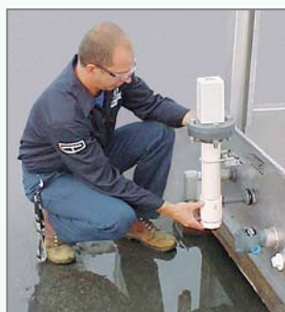
Electrical Water Level Controls