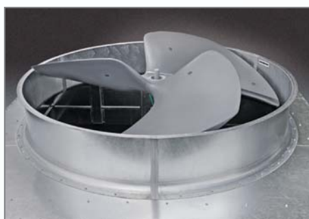
Super Low Sound Fan