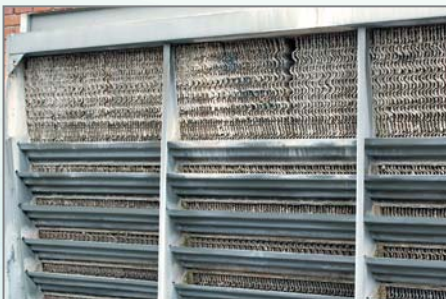
Old, Inefficient, Damaged Fill