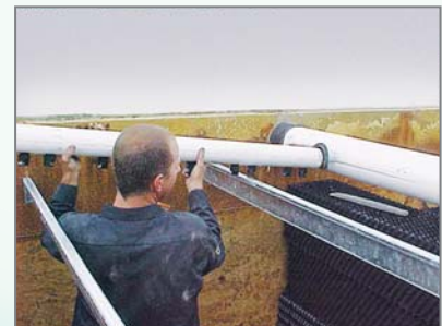
Water Distribution Systems and Counterflow Fill

Mr. GoodTower® Service Centers will evaluate existing equipment layouts and recommend replacement units.