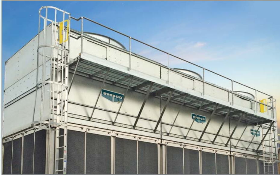
Custom Platforms and Ladders