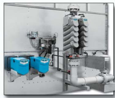
Smart Shield® Solid Chemical Water Treatment System