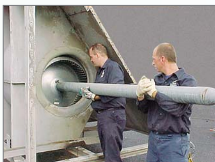
Fans and Shaft Kits