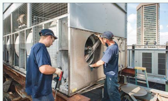
Shaft Inspection and Bearing Lubrication

Mr. GoodTower® Service Centers stock parts for emergency repairs!