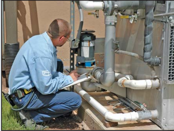
FREE Unit Inspections!