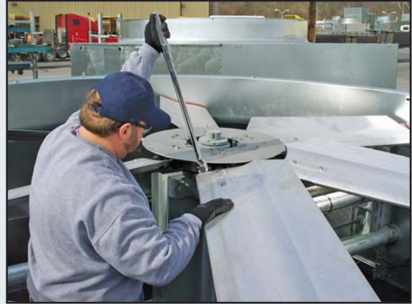
Factory Trained and Certified Mechanics