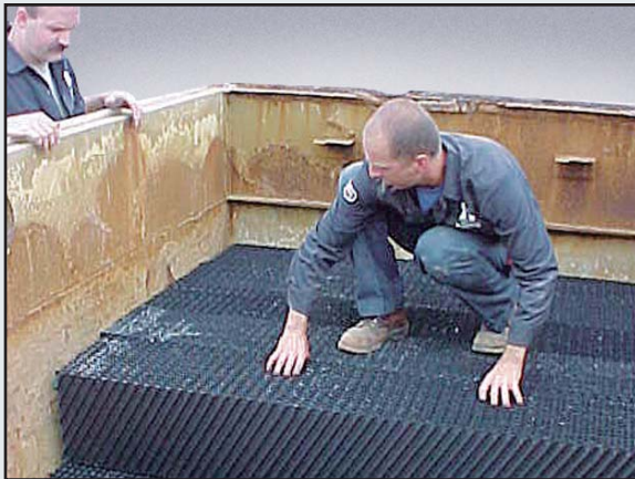
Improve Thermal Performance