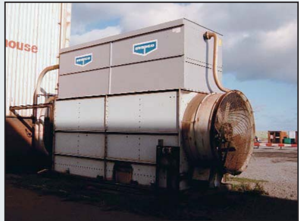
Extend the Life of Your Equipment