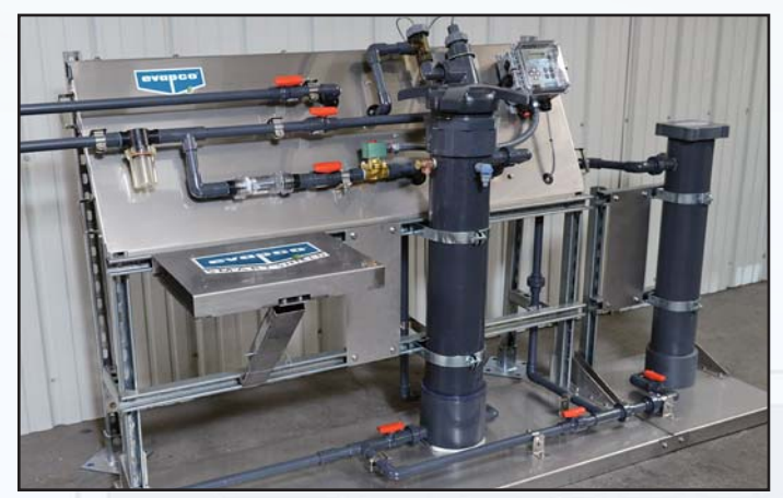
Controlled Release System (CRF-1 shown)

Contact your local EVAPCO Representative to learn whether the Controlled Release or Monitored Release System is right for your open evaporative cooling application.