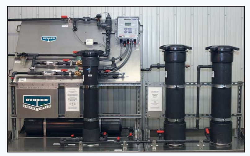
Monitored Release System (MRF-2 shown)